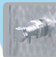
Sampling valve DN20