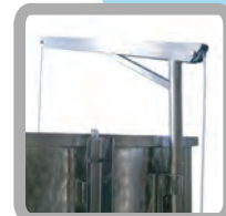
Crane for floating lid