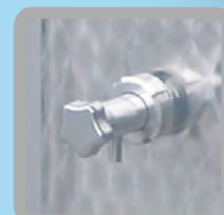
Sampling valve DN20