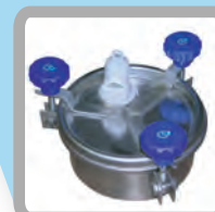
Top manway door D200