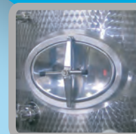
Oval manway art. Laveggi A5