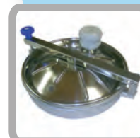
Top manway door D400