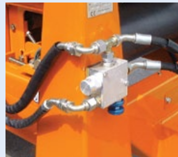
Hydraulic distribution unit