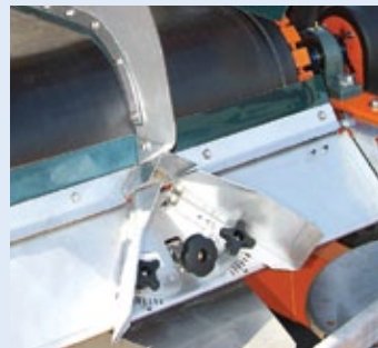
Distribution unit in stainless steel