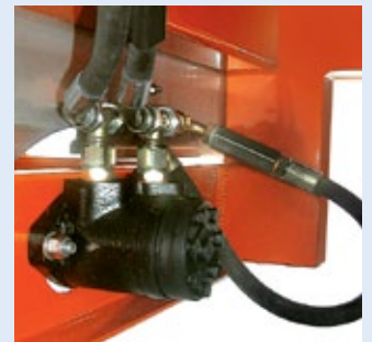
Hydraulic motor drive disks

The intense frost in colder months, especially if unexpected, always cause considerable discomfort and inconvenience to road traffic. Roads, airports, parking, and highways can get obstructed or dangerous because of strong snowing. To make roads viable and safe it is necessary to distribute sodium chloride on private and public areas.