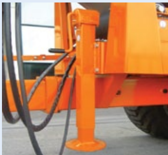
Parking support leg