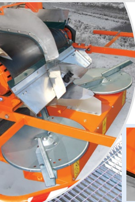
Hopper loading grid