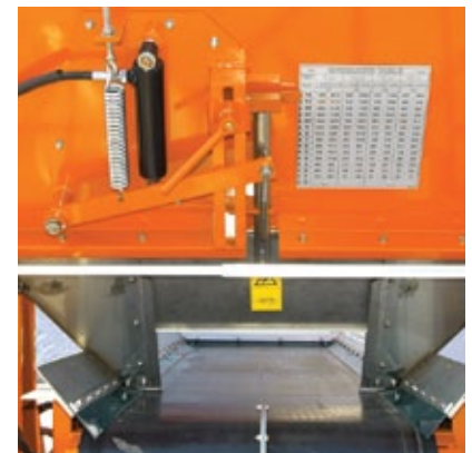
Salt/sand hydraulic dosing