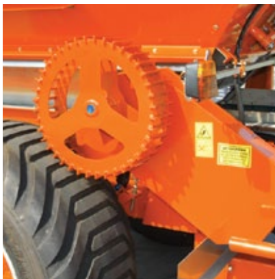
DPA volumetric wheel