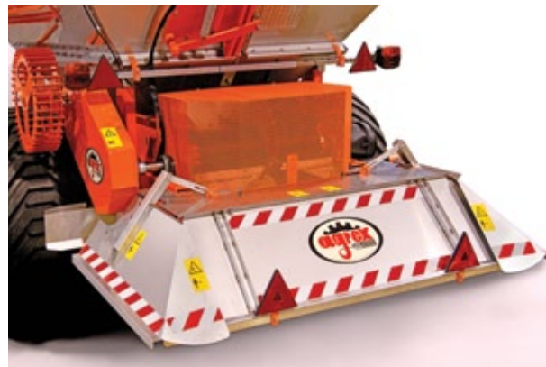
Salt/sand spreader stainless steel deflector